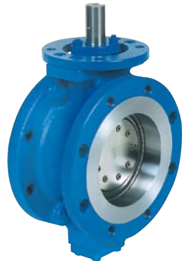
Double Flange Long Pattern

ASME B16.10 Tables 1 & 2 (Gate) 4" to 12" 150/300 Class