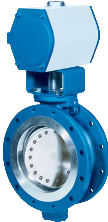
Double Flange Short Pattern

ISO 5752 Table 4 Short 3" to 24" 150/300 Class